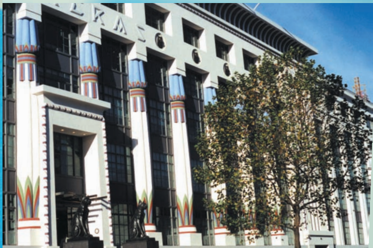
Greater London House