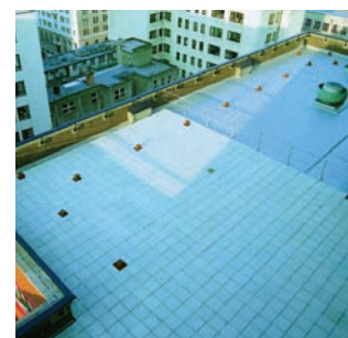
Birmingham College of Food