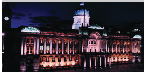
Birmingham City Council Offices

For reference purposes, full details of individual projects, specifications, value, client contacts and addresses are available.