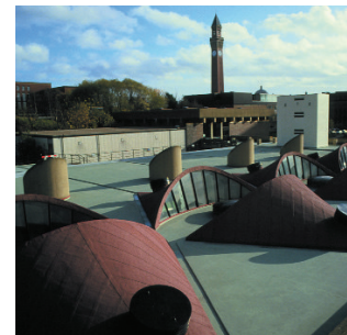
Asphalt &amp; Felt