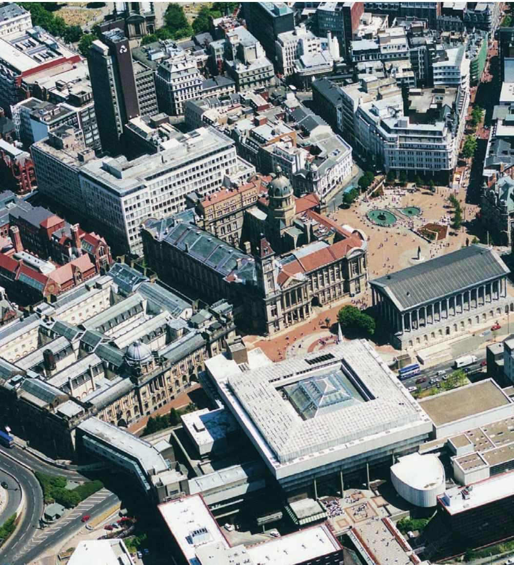
Birmingham City centre

Rio Asphalt & Paving Company Limited and Rio Surfacing Limited offer technically-backed, practical and commercial advice. Each offers on-site surveys for a variety of planned maintenance programmes and other types of projects.